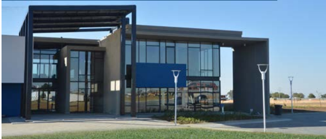
Sasol Business Incubator Main Building

The facility comprises five main areas including: